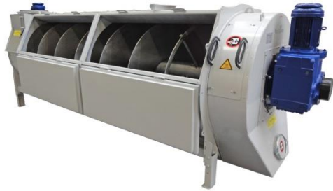
Long term conditioner

In long term conditioners, time can be increased to 4 minutes. This conditioner contains steam mixer, automatic control of steam quality, and retention for long time which has a remarkable role in improvement of cooking process. This cooking method can improve nutritional quality of feed and also increase pellet quality.