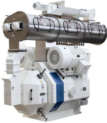
Single and simple horizontal conditioner