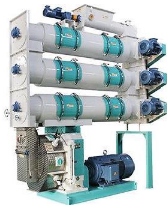
Three stages conditioner

Double and triple conditioners contains two or three cylinders, respectively, which each cylinder can have one or two moving shafts. In these conditioners, retention time increases and consequently feed cooking happens more deeply.